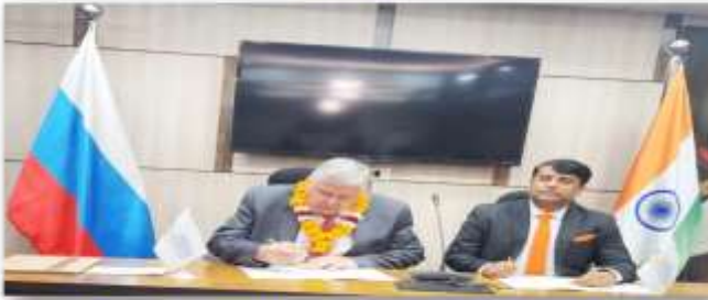
Table 1 Eurasian People's Assembly & Economic Council Of India (ECI) Inked Cooperation Agreement

ECI Headquarter, New Delhi, 23 rd March 2023, The Eurasian People's Assembly & Economic Council of India (ECI) inked 'Cooperation Agreement' to support and promote the Peace Led Sustainable Socio-Economic Co-development & Co-existence to strengthen the EURASIAN Economy.